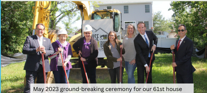
May 2023 ground-breaking ceremony for our 61st house

MISSION: Habitat for Humanity in Monmouth County is dedicated to safe and affordable homes through constructing, rehabilitating and preserving homes; by advocating for fair and just housing policies; and by providing training and access to resources to help families improve their shelter conditions.